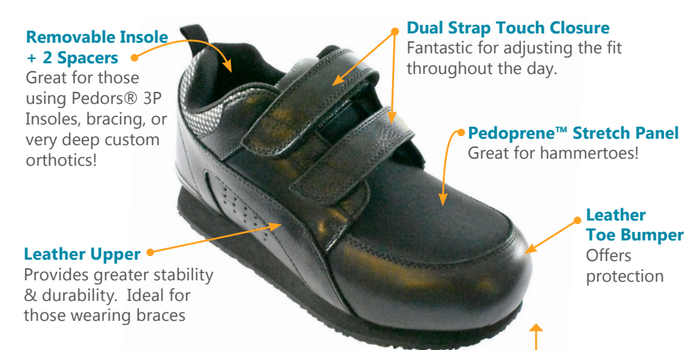
Toe Spring Reduces risk of trips and falls

Designed For: Accommodating AFO's, hammertoes, bracing, custom orthotics, edema. Removable spacers for additional depth